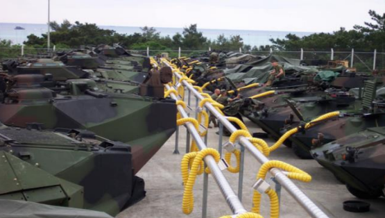
Figure 3-2: CHP Operational Preservation Application