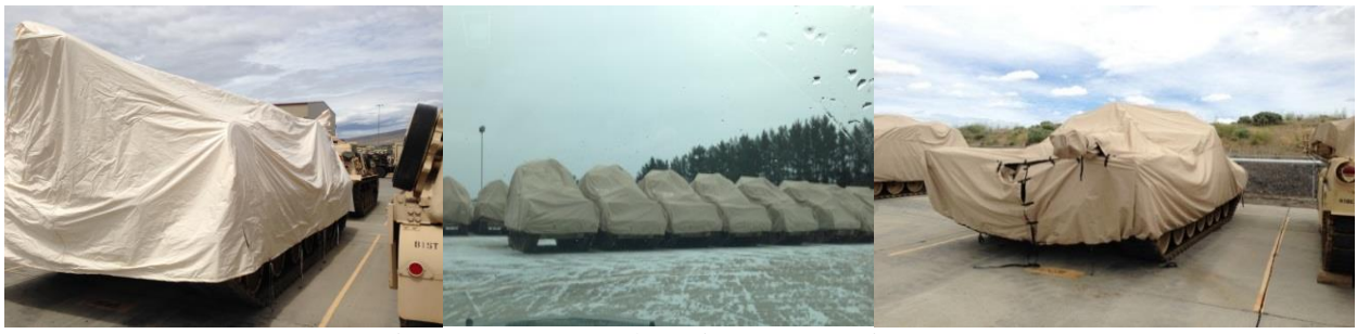
Figure 1-3. CHP Tool, Equipment Protective Cover