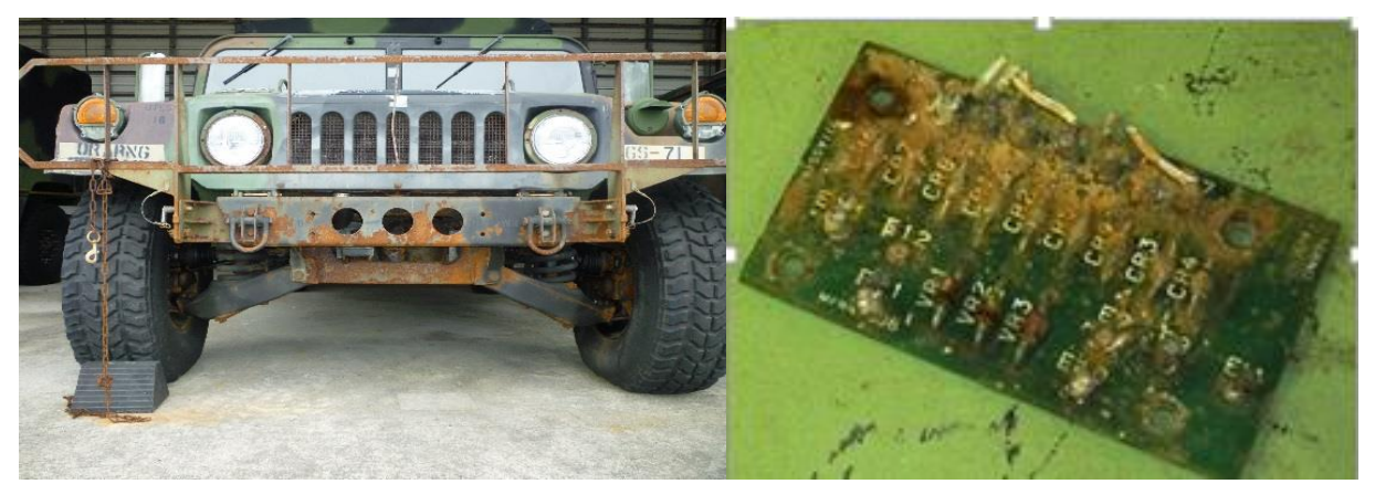
Figure 1-1. Corrosion Impacts

surfaces is not done as part of preventive or corrective maintenance, loss of equipment from service and high replacement rates will continue to impact equipment readiness.