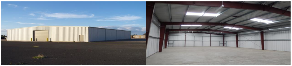
Figure 1-2. CHP Tool, Shelter