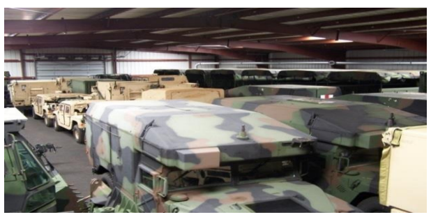
Figure 3-1: CHP Shelter Based Application